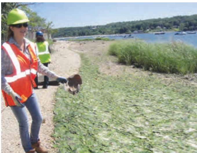
Exxon scientists inspecting beach conditions.