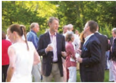
Committee members enjoy kick-off festivities