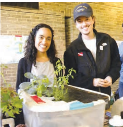
Boswyck Farms staff demonstrate hydroponic growing in a soda bottle

Interest in growing and farming on Long Island is a booming enterprise as evidenced by the 800+ people who enjoyed the Small Farm Summit on Saturday, April 14 at Hofstra University. More than 30 organizations, led by the North Shore Land Alliance and including Hofstra University, Whole Foods Market and the New York State Conservation Partnership Program stepped up to sponsor the second annual Small Farm Summit. It was an extensive day of learning, hands-on instruction, entertainment and networking focused on growing more food locally for individual use, in schools, to feed people in need and to grow the local economy.