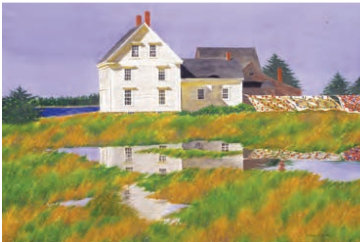
After The Rain (21H" x 28W")

To order these beautiful prints, please contact the Land Alliance directly.