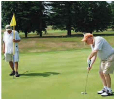
Golf Outing participants enjoy a perfect weather day

We are most thankful to our sponsors and contributors and to all who participated in making this year’s outing such a success!