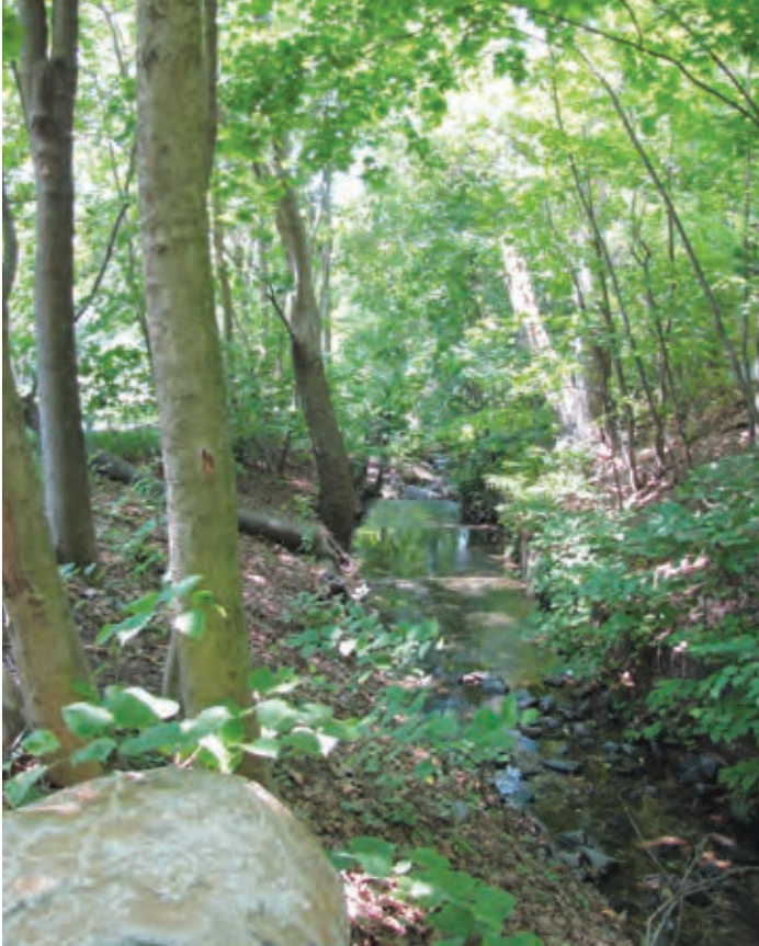
The transformation from drainage ditch to meandering stream