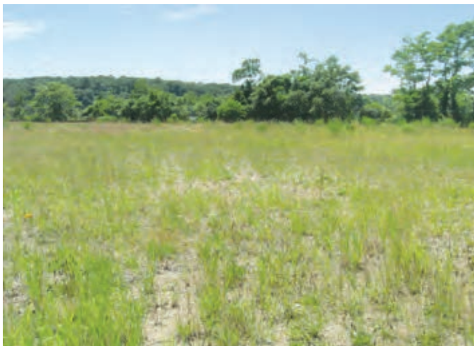
Grasses planted in Fall 2011 have begun to grow.