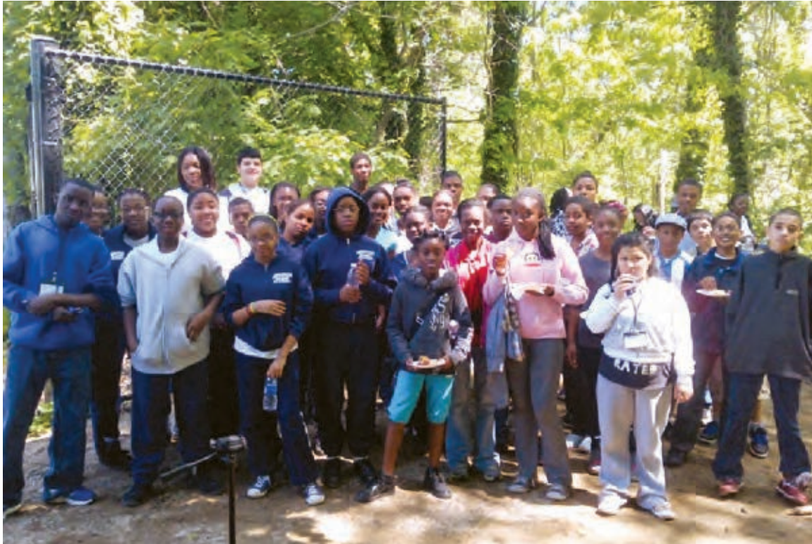
Students and teachers from the Roosevelt Middle School and Roosevelt Children's Academy who assisted with planting and clean-up

For five years, the Land Alliance has been collaborating with the students, teachers, residents and community leaders of Roosevelt to help protect our planet and local natural areas for future generations. On May 17th, after much rescheduling due to rain and school tests, the Land Alliance met with two groups of students from schools within the district for our annual spring event at the 73-acre Nassau County-owned Roosevelt Preserve.