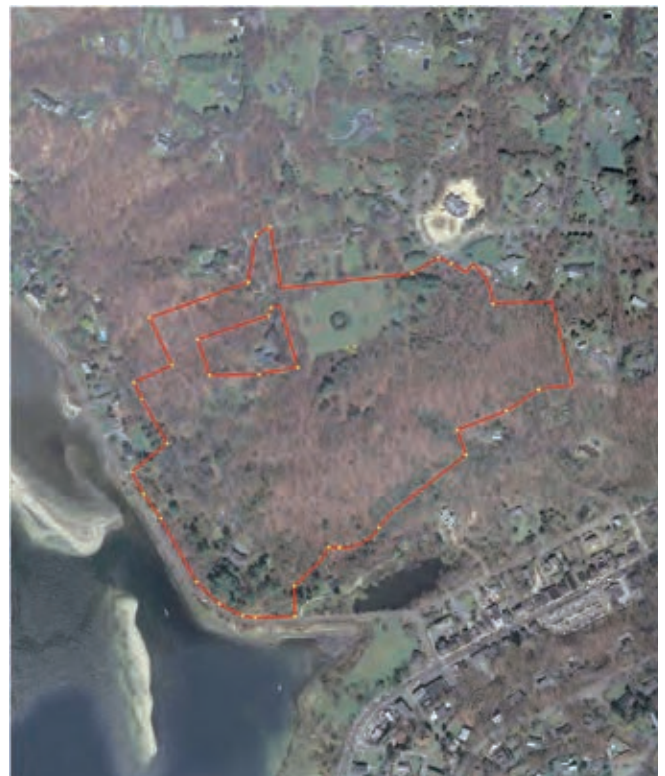
DeForest Williams aerial photo.