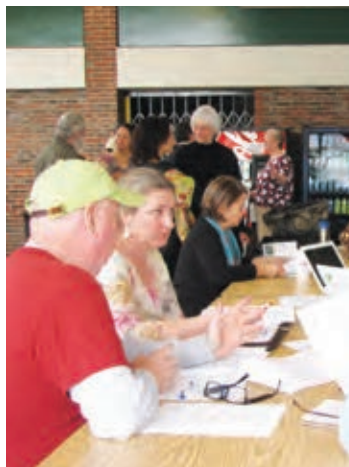
Farm Summit Steering Committee Members Plan Curriculum and Organize Volunteers.

Already ten religious congregations have committed themselves to donating to food banks vegetables that they will grow this season at new gardens dedicated for that purpose, most on their own property.