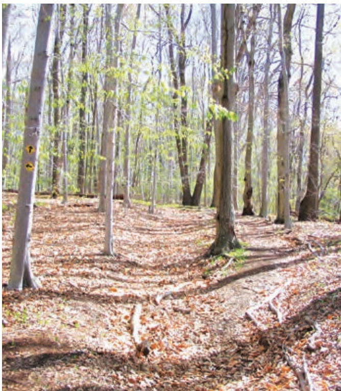
One of many inviting paths in the Fox Hollow Preserve

The Fox Hollow Preserve is located in the Village of Laurel Hollow and contains 26 acres of mature oak woods. In 1969, The Nature Conservancy received funds from Mrs. Walter H. Page of Cold Spring Harbor that allowed for the acquisition and permanent protection of the Preserve. Unknown to most, this Preserve was once a portion of a 1,000-acre farm with milk cows, horses, chickens, ducks and geese and surrounded by forest. Today, foot trails traverse the wooded Preserve providing opportunities to view numerous species of birds and a vast array of trees.