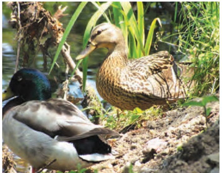
Early residents of Stannards Brook Park