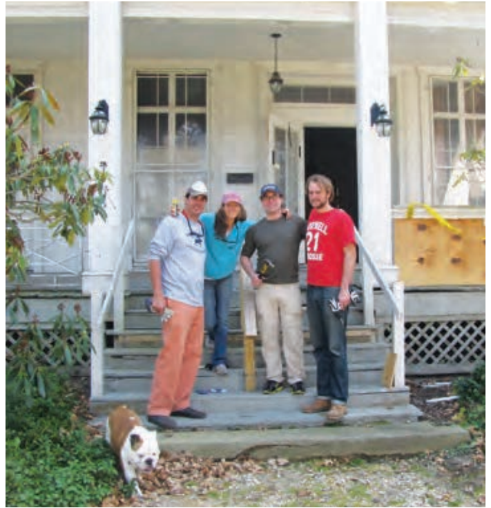
Young members helped with repairs at the Trousell House in Oyster Bay