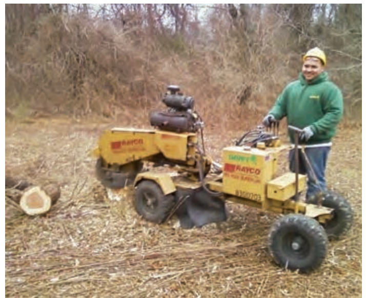
Rudy of Davey Trees assist with stump grinding at Iselin Preserve

May this be the beginning of many such efforts where non-profits and community members work together to protect and preserve our vital natural areas.