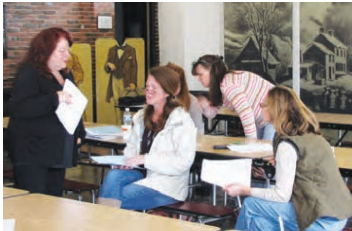
Volunteers plan curriculum for School Gardens and Plant Food Everywhere presentations.

To help insure the success of these new gardens and others yet to come, LICAN has held educational workshops for congregational garden leaders and tuition-free workshops for expert gardeners to mentor the congregations. Grants from the Long Island Community Foundation and the New York Community Trust: Horace and Amy Hagedorn Fund provide funding to pay the mentors, as well as underwriting the educational workshops and a guide that will be made available free to interested parties.