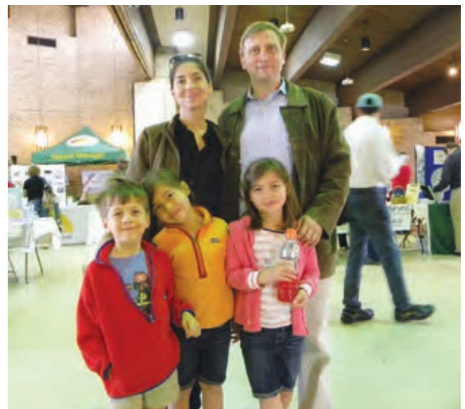
The Cushman Family in the exhibition hall