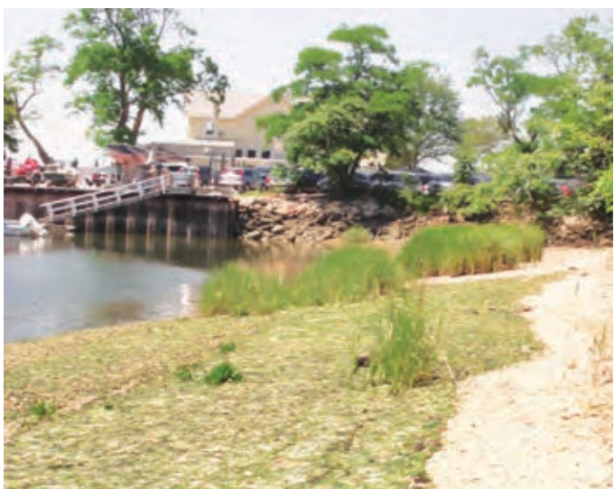
The view from the water.

For many Long Islanders, the former Cold Spring Harbor terminal is a recent memory. However, the property is currently under restoration with plans to enhance and replenish this coastal habitat and secure its future preservation.