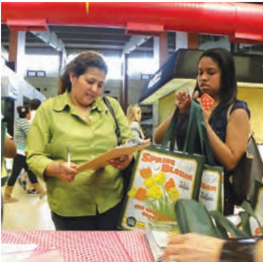
Registration and goody-bag distribution