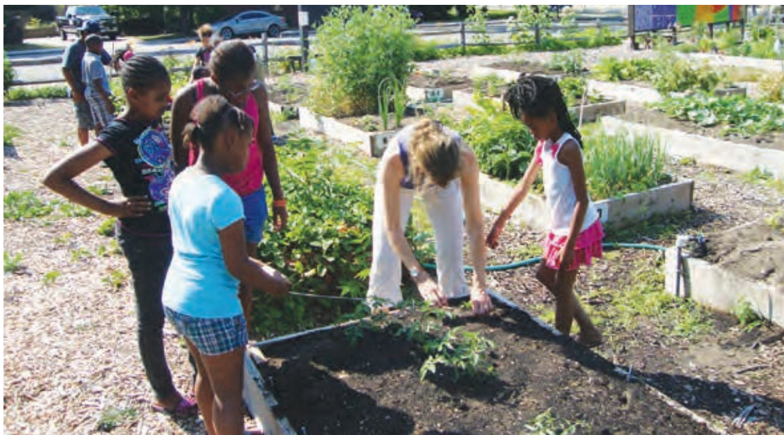
The Gateway Green Team in action preparing the raised beds for the square foot gardening method

LICAN is a project of the Open Space Institute, Inc. Citizen Action Program. Congratulations to all on setting such a great example!