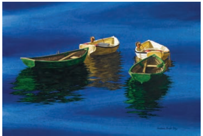
Old School (14H" x 19W")